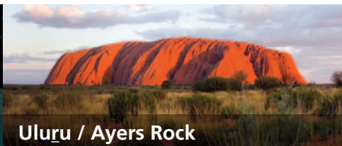
Uluru / Ayers Rock